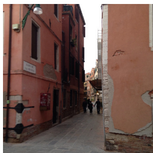
5. Turn right following this street