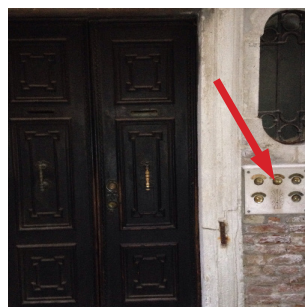
7. After 20 metres on the left arrived (House number 3450 ). Ring the bell in the middle name TAVANO BLESSI