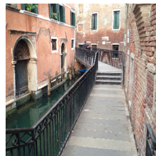
4. Straight on and than on your left