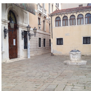
2. Take this street