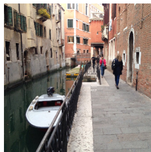
3. Straight on follow this street