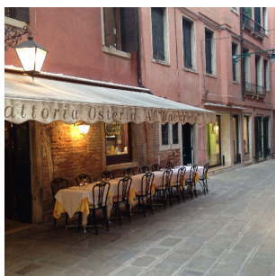
6. Turn Left on take this street (Calle Crosera/Calle Delle Botteghe)