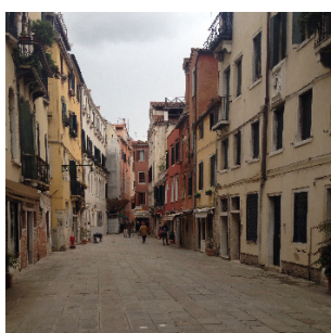
3. Go straight