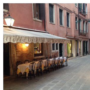
4. Right on this street