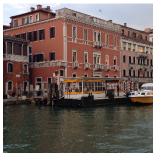
1. Sant Angelo stop