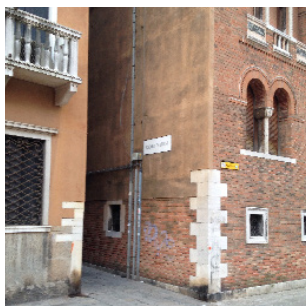
2. Get off, straight on than turn right