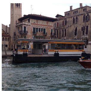
1. San Samuele stop