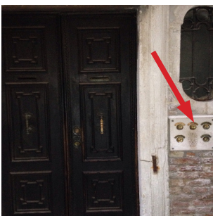
6. After 20 metres on the left arrived (House number 3450). Ring the bell in the middle name TAVANO BLESSI

We are located in Calle delle Botteghe (the blu line in the map) nearby Campo Santo Stefano (Campo Santo Stefano is in the centre of the map). Civic number is 3450 (the red point) Ring the bell Tavano Blessi - Santo Stefano. Tel numbers: +39 (if from outside Italy or foreign phone) 333 2353779