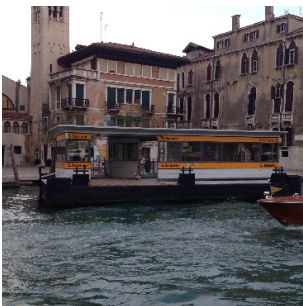
1. San Samuele stop