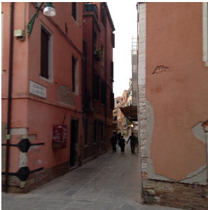
5. Turn right following this street