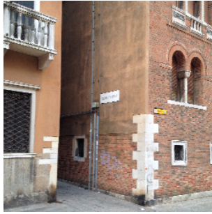
2. Get off, straight on than turn right