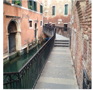
4. Straight on and than on your left