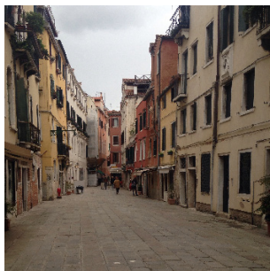
3. Go straight