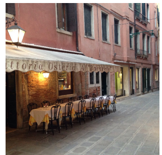
4. Right on this street