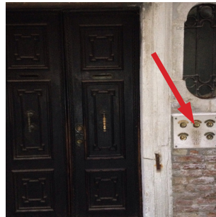
7. After 20 metres on the left arrived (House number 3450). Ring the bell in the middle name TAVANO BLESSI