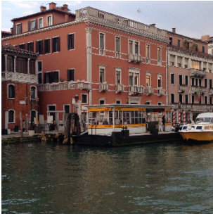
1. Sant Angelo stop